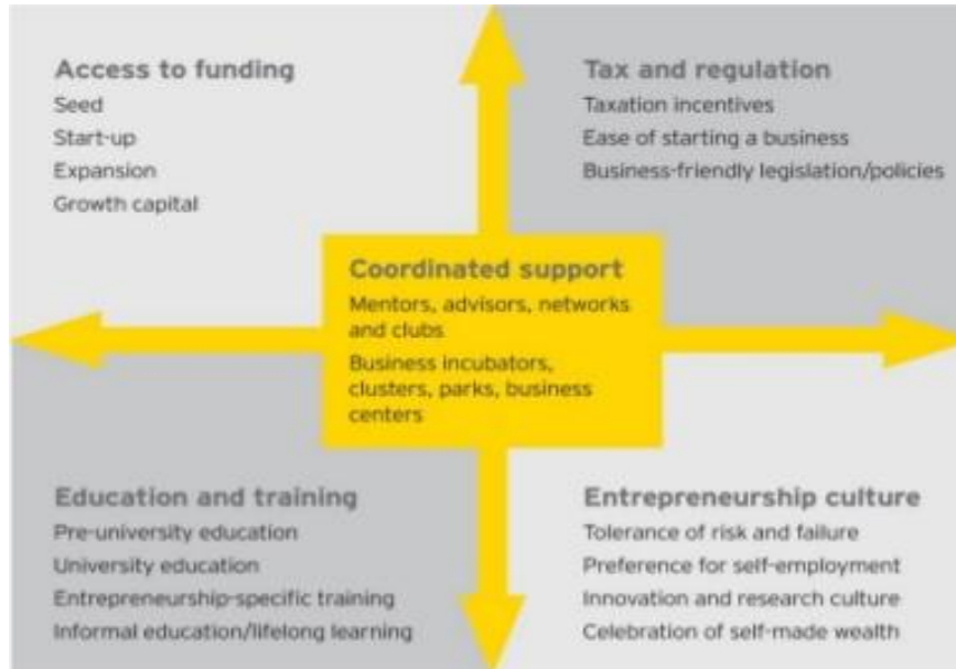
Figure 2: Entrepreneurial Development Framework